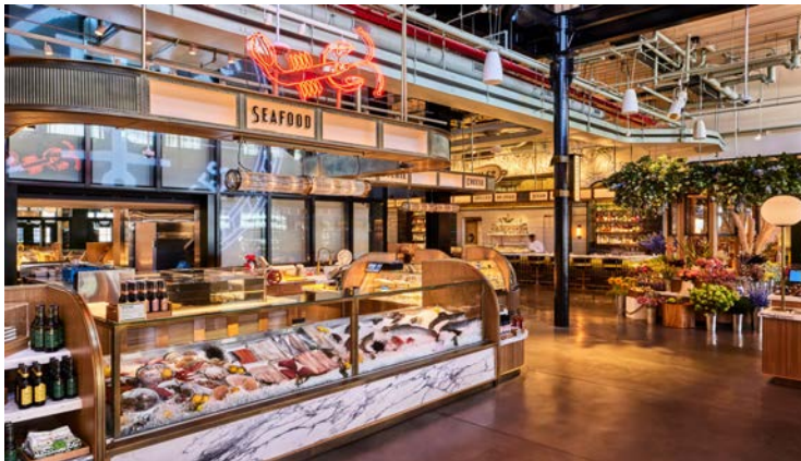
FRESH MEATS AND PRODUCE