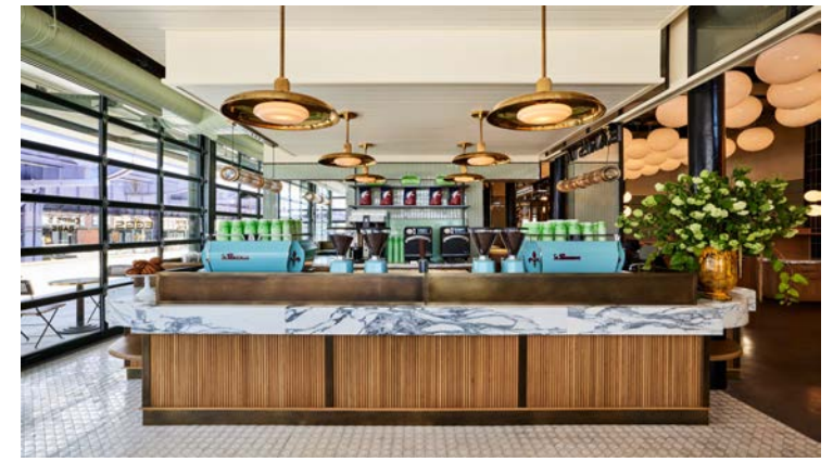
BAKERY AND COFFEE SHOP