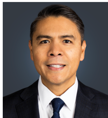
President of the Nevada Region for Howard Hughes