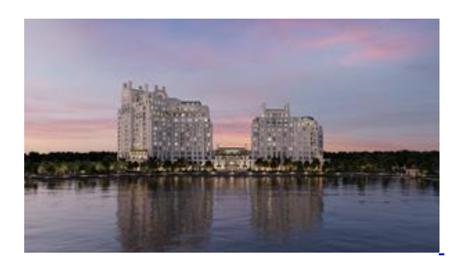
The Ritz-Carlton Residences, The Woodlands

The Ritz-Carlton Residences, The Woodlands Porte Cochère