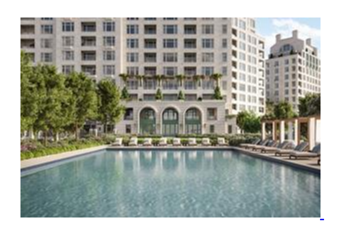
The Ritz-Carlton Residences, The Woodlands Resort Pool