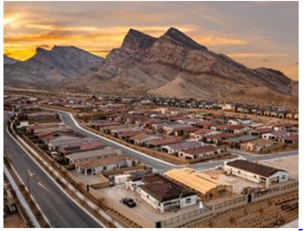
Summerlin®, Las Vegas, Nevada