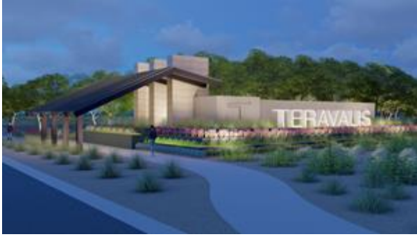
TeraValis Community Entrance