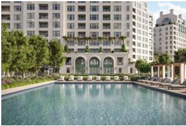
The Ritz-Carlton Residences, The Woodlands – Resort Pool