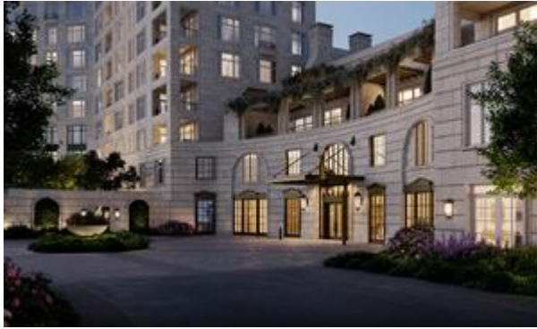
The Ritz-Carlton Residences, The Woodlands – Porte Cochère