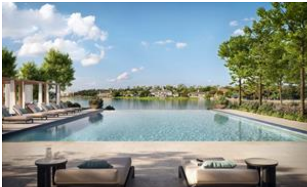
The Ritz-Carlton Residences, The Woodlands – Resort Pool View