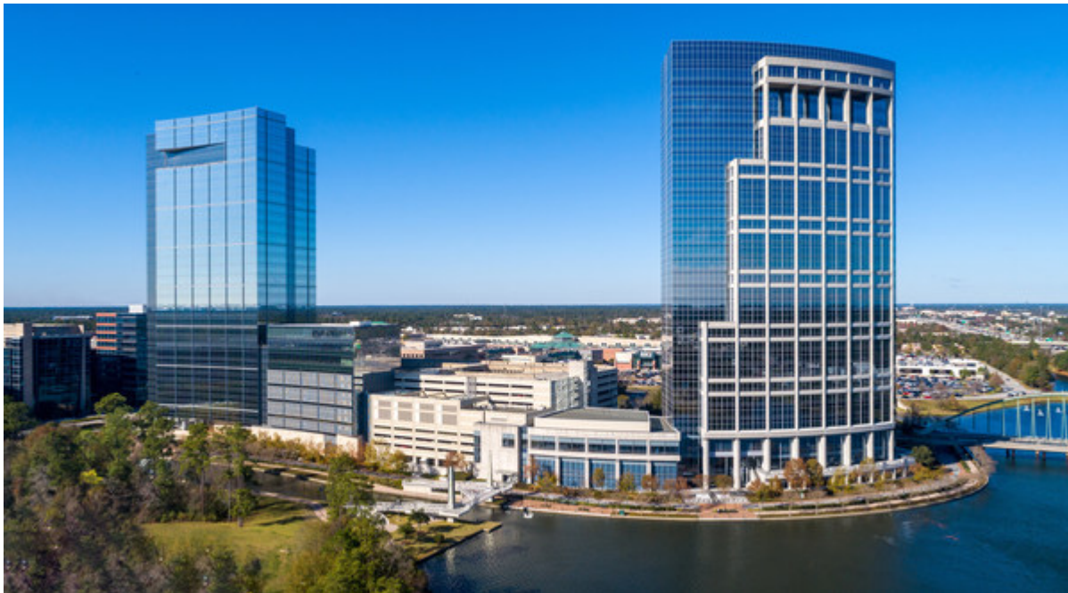
The Woodlands Towers at The Waterway

The $565 million transaction also includes the acquisition of Occidental's Century Park campus in the West Houston Energy Corridor—a 63-acre, 1.3-million-square-foot campus with 17 office buildings—which The Howard Hughes Corporation will immediately remarket, in line with its recently announced commitment to sell non-core properties and to focus resources into the growth of its core business of MPCs.